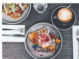
The Guilty Moose, Victoria Avenue, Albert Park