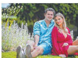
St Vincent Garden, Albert Park