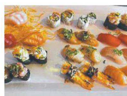
Misuzu's, Victoria Avenue, Albert Park