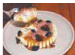
Vex Dining, High St, Northcote