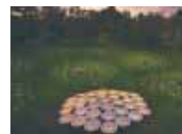
Heide Museum of Modern Art, Templestowe Rd, Bulleen