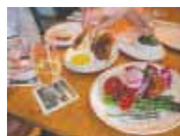
LongPlay, St Georges Rd, Fitzroy North