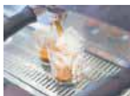
Cafe Piccante, St Georges Rd, Fitzroy North